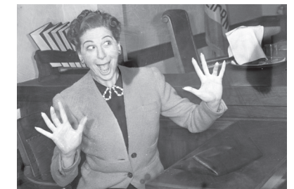
Fanny Brice, 1938

Taking up that call, Jewish writers and performers in the United States have long made comedy out of their position as (relative) outsiders. In the early 1900’s, Fanny Brice called out and critiqued Jewish stereotypes with outlandish parody songs like “Sadie Salome go Home” and “The Yiddish Bride.” The ‘Golden Age of Radio’ of the 1930’s-40’s featured the popular